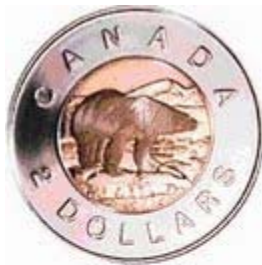
2 Dollar Coin "Toonie"