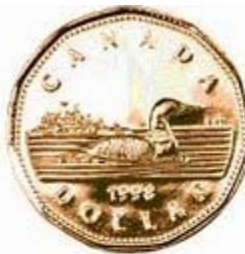
1 Dollar Coin "Loonie"