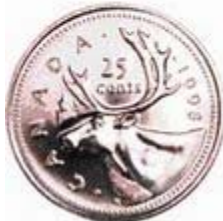
25 Cent Coin "Quarter"