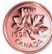
1 Cent Coin "Penny"