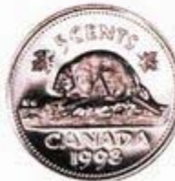
5 Cent Coin "Nickel"