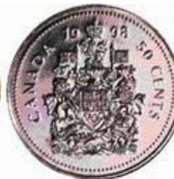
50 Cent Coin