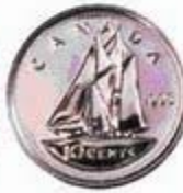
10 Cent Coin "Dime"